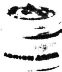
Equal Amount Eyelastic Lift & Firm Creme