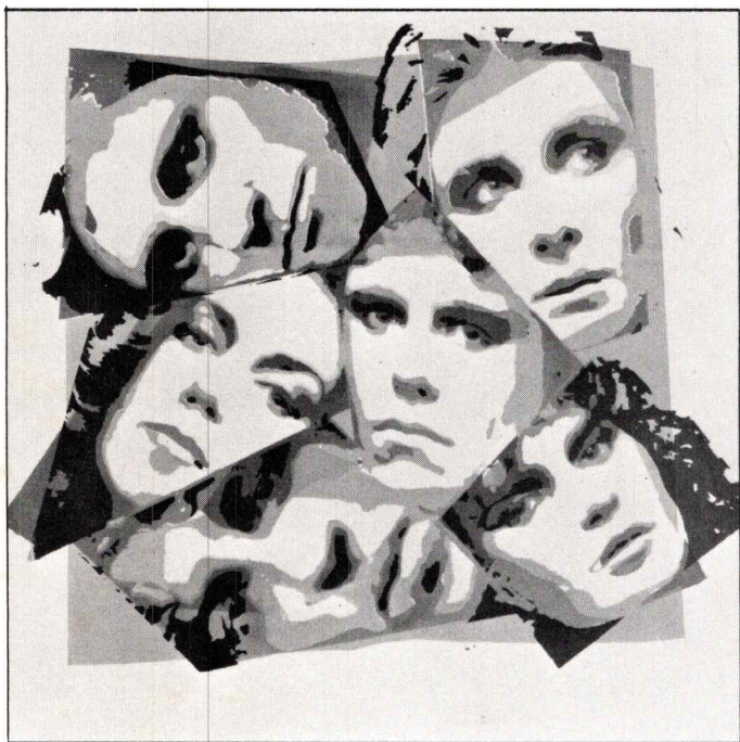
Album Cover Without Type